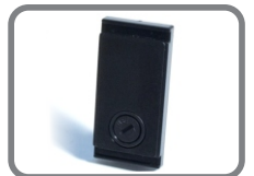
Single Fuse Module