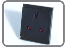
UK Socket Module

Unilink is designed to simplify distribution of power and data and unify the outlet structure; it can be used in virtually every application throughout the building. Uni-Link is the first ever Grid Outlet Position (G.O.P) product to offer true 19" rack mountability.