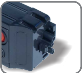
Lockable ST18 Power

Modular Power and Data Distribution for the Desk, Cabinet or Wall