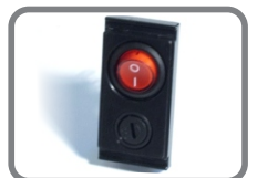
Switch & Fuse Module