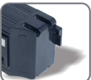
Screw Mounting with blanked end