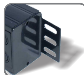
19" Rack Mounting