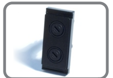
Double Fuse Module