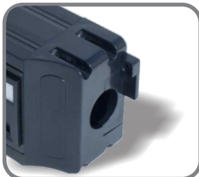
Screw Mounting with cable exit